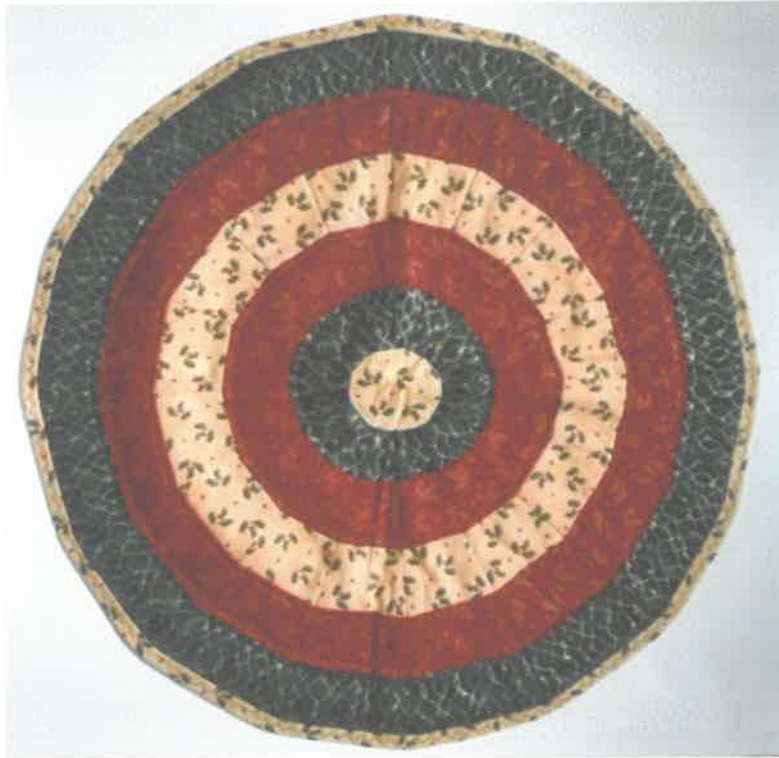
Approx. finished size: 23" diameter By Valerie Nesbitt